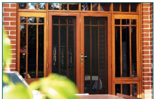
Timber effect entry doors