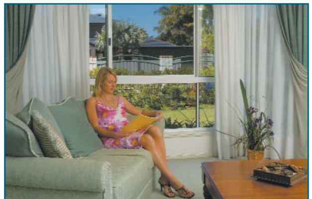
Safety and a view