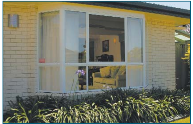
Minimal visual impact